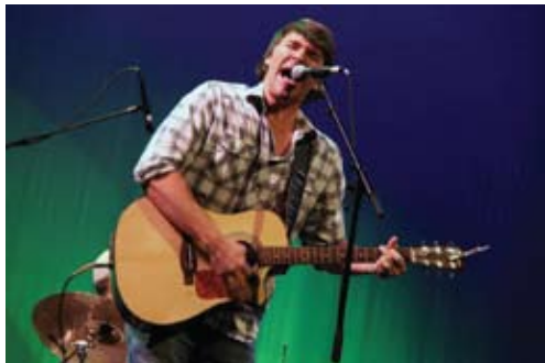
The Pick Bristol campaign was unveiled at the Paramount Center. In addition to a pickbristol.com website preview, These Undowners, a favorite local band, performed their original song, “State Line State of Mind.”

With motorsport solidly branded, the Bristol Convention Bureau decided to focus on efforts to increase awareness and support of Bristol’s place in history as The Birthplace of Country Music.